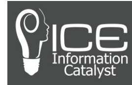
Information Catalyst, United Kingdom